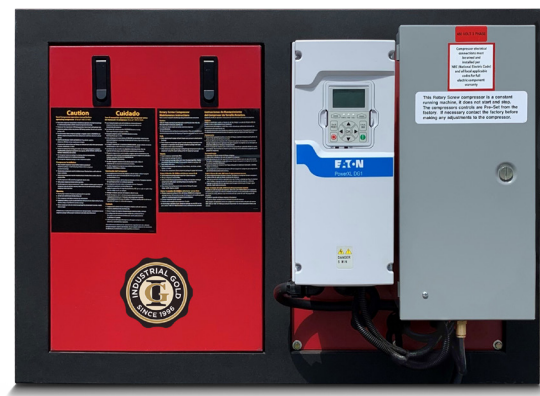
Package with VFD drive system installed