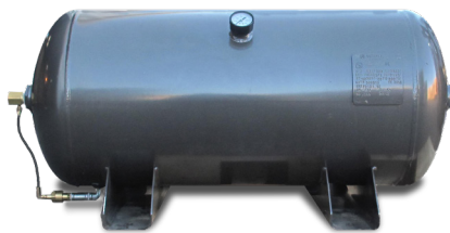
Pictured with optional air storage receiver