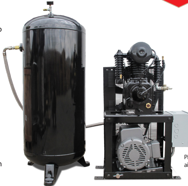
Pictured with optional air storage receiver