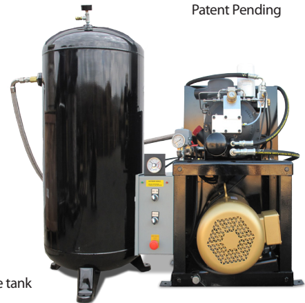
Pictured with optional storage tank