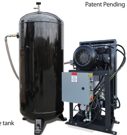
Pictured with optional storage tank