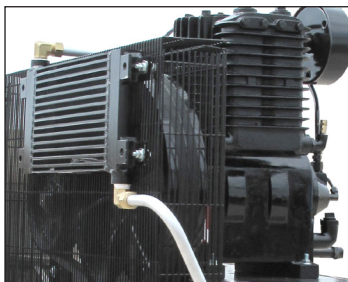
Air cooled after cooler Platinum unit