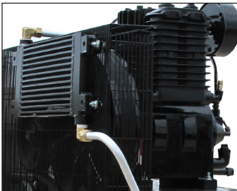
Air cooled after cooler Platinum unit