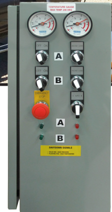
Quad "O" Control Panel