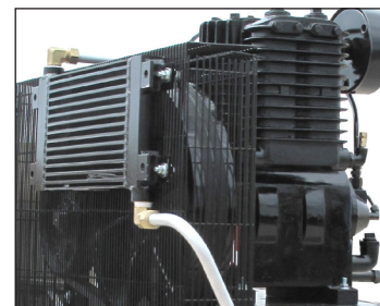
Air cooled after cooler Platinum unit