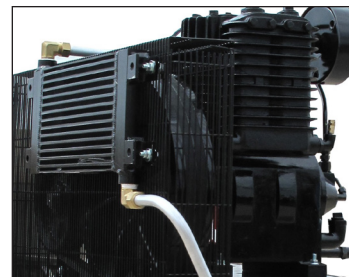
Air cooled after cooler Platinum unit