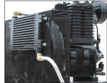
Air cooled after cooler Platinum unit