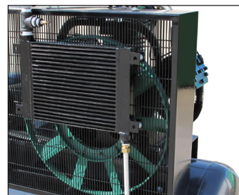
Air cooled after cooler Platinum unit